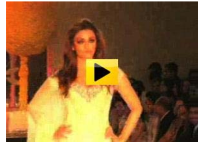
Grand 'Godh Bharai' for Ash today

Submit your Videos along with brief captions: To the Webmaster.